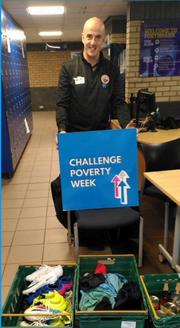
Stirling Albion FC host a kit recycling event at a weekend game during Challenge Poverty Week 2023

Challenge Poverty Week presents an opportunity to showcase the work you are already doing to tackle poverty or to raise awareness of poverty in your community.